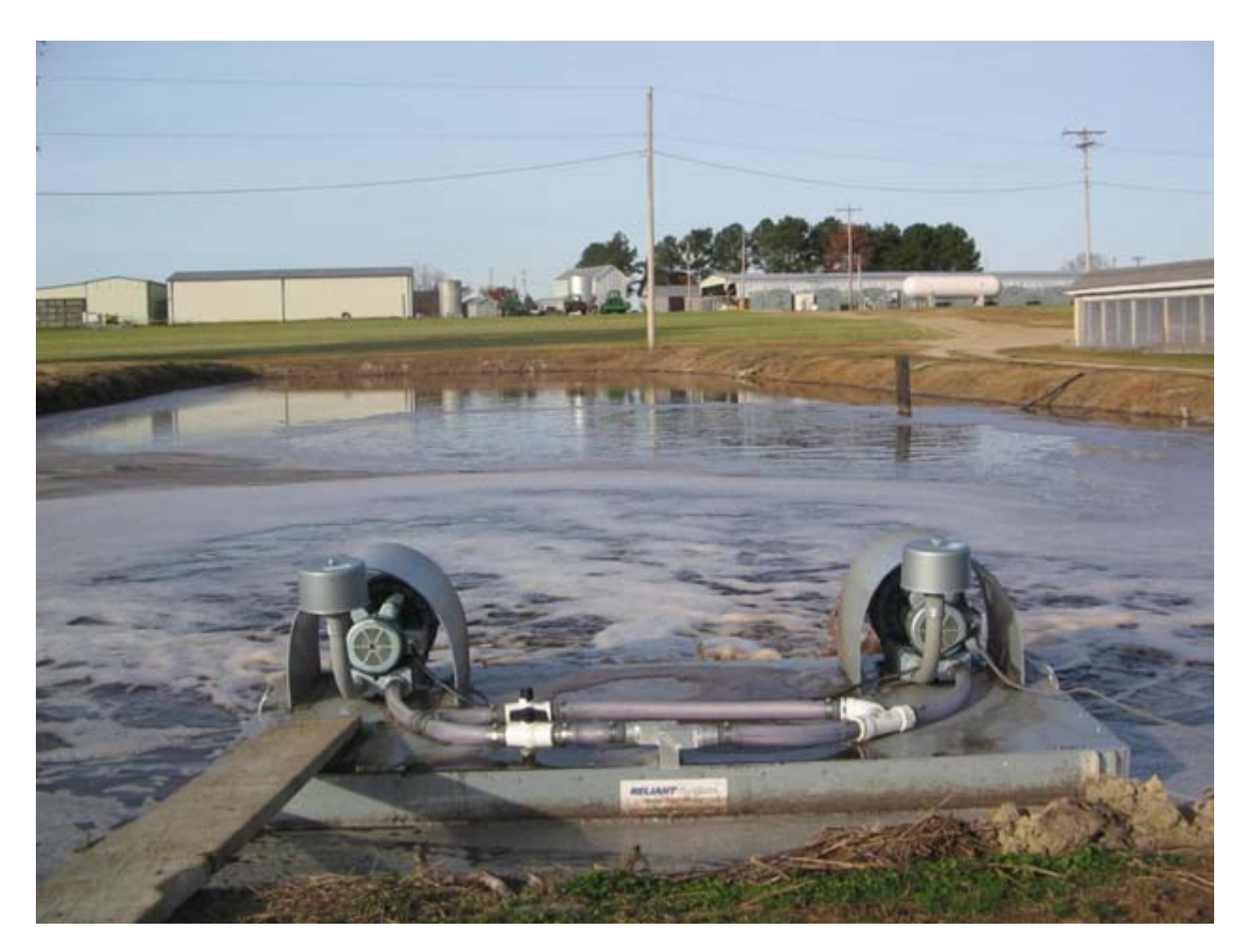
Figure 2: Reliant Model WQA Water Moving Aerator located in one end of the hog lagoon. Photo was taken approximately 15 days after aerator startup.

Close observation was kept on the odor in the lagoon for the first several days. Within 36 hours there was no real odor emanating from the lagoon. After that time, the only odor witnessed was a somewhat 'musky' smell; but, it was not as strong and repugnant as when the aerator was put into place. Everyone gave the odor a rating of 1 to 2 in our non-analytical measurement scale. The solids in the lagoon were measured with a Sludge Judge® just prior to the aerator being turned on.