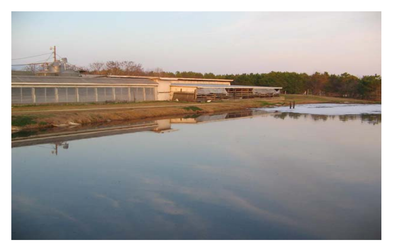
Figure 3: Appearance of the hog lagoon after 60 days of the trial. Note that no sludge is breaking the surface and that all shoreline sludge and foam are no longer present.

One of the more interesting, -and important, - results of this trial, was what the Model WQA aerator and Sewper Rx proved very successful in improving the water quality of the surface water throughout the lagoon. Figure 4 is a 60 day graph of the measured ionic components of the water. In every case the reduction of these water quality parameters was reduced a minimum of 50% in the water column above the sludge. It should be remembered that, throughout the trial, the daily waste of 200 full grown sows was still entering the lagoon.