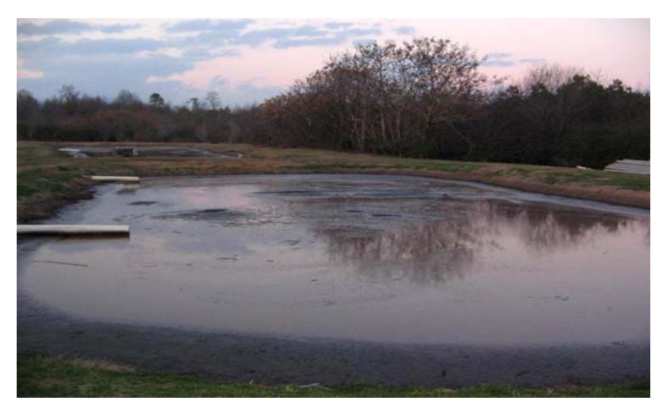
Figure 1 – Small hog lagoon in North Carolina. Sludge in the lagoon reached all the way to the surface of the lagoon when we arrived.

A North Carolina hog grower with a brood barn of 200 full grown sows contacted Reliant Water Technologies to see if we could assist him with one of his waste lagoons. All of his lagoons were identical, measuring only .05 acres in size, and designed to be 8 feet deep. When we arrived at the farm all of the lagoons looked like the one in Figure 1 . The lagoon that he chose for us to work with was located closest to the barn, and his goal was to use the water on the surface of the lagoon as wash-down water for the barn. Because the sludge was breaking the surface of the lagoon there was a very unpleasant odor emanating from the lagoon. Due to problems with the plumbing to the other lagoon, all hog waste would be directed to the trial lagoon during the trial period.