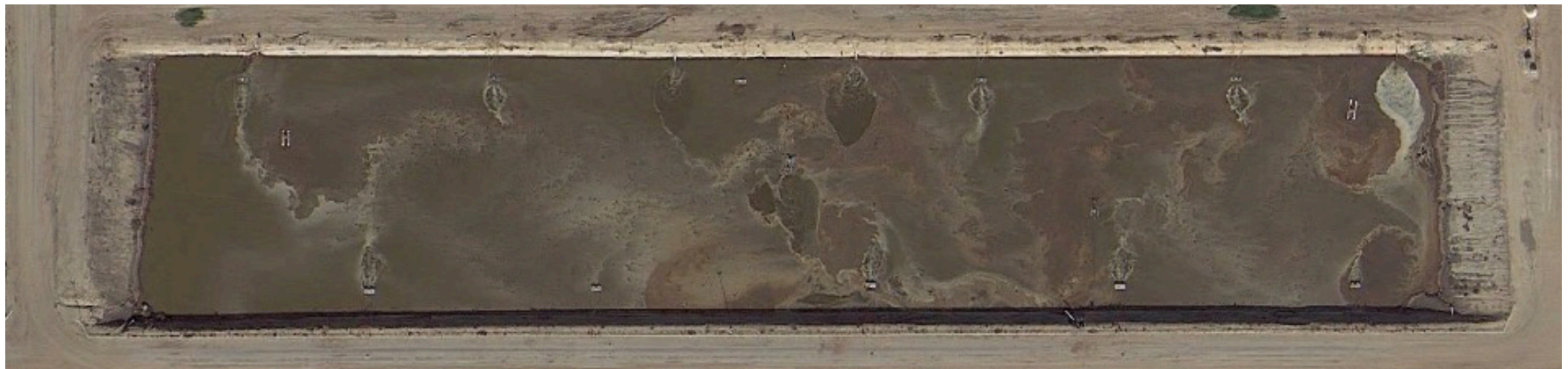
Mixing using LAGOON COMMANDER Mixers

Results – Total and complete mixing & reduction of odor