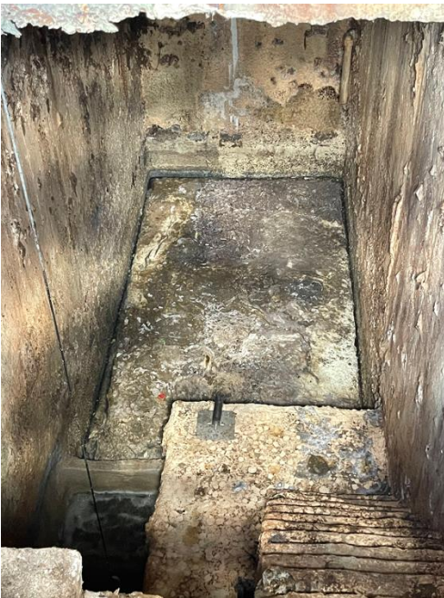
A large +250sqft wet well with a 2.5 foot thick FOG cap. Four Wizards required. Corroded concrete throughout the well.