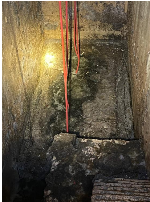
Same wet well at Wizard startup. 255ppm of H 2 S at the time of startup