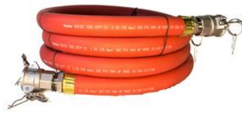
Three ply reinforced EPDM air hose w/ Cam Loc connections

Brass and stainless steel Cam Loc hose connections