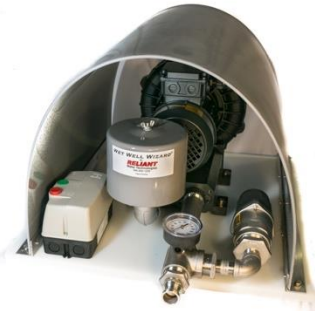
Blower, SS manifold with over-pressure protection, manual starter, auto-restart