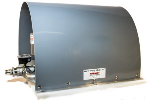
HDPE Blower Weather Cover